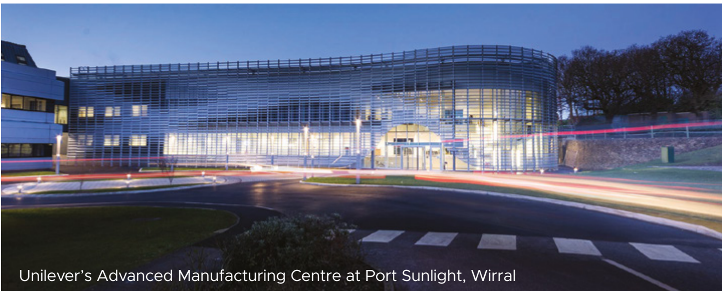
Unilever's Advanced Manufacturing Centre at Port Sunlight, Wirral

Other major bio-manufacturing investors in the city region include Teva, Nutricia, Vitaflo and Baxter Healthcare.