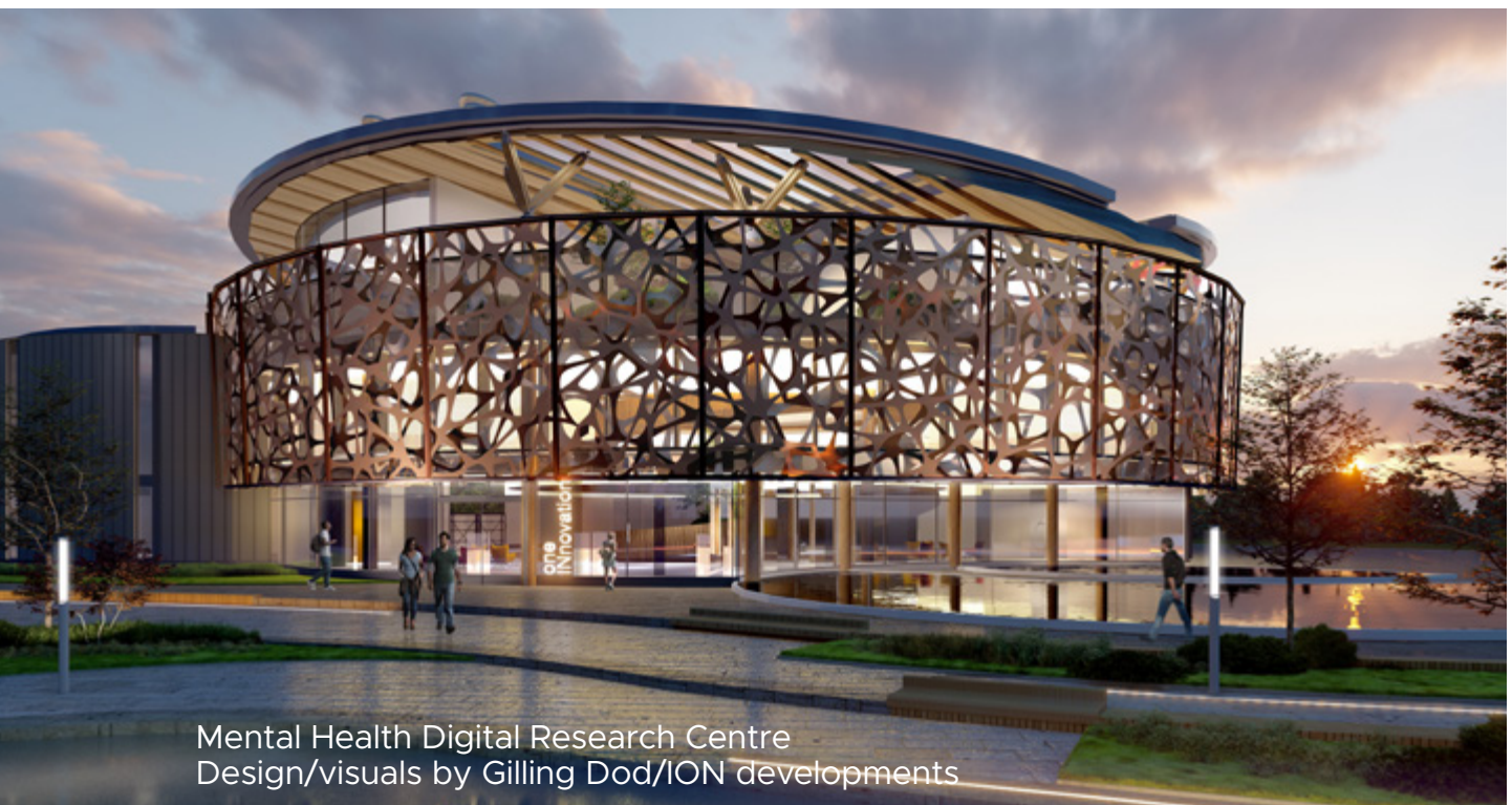
Mental Health Digital Research Centre Design/visuals by Gilling Dod/ION developments

The Mental Health Digital Research Centre (MHDRC) will apply UK and world-leading capabilities, expertise and assets to improve mental healthcare as it seeks to address deep rooted inequalities, improving equity of access to better care and providing better outcomes for patients locally, nationally and internationally. The MHDRC will be built for sustainability, with immersive and interactive spaces, augmented reality labs, accommodation, and space for future expansion.