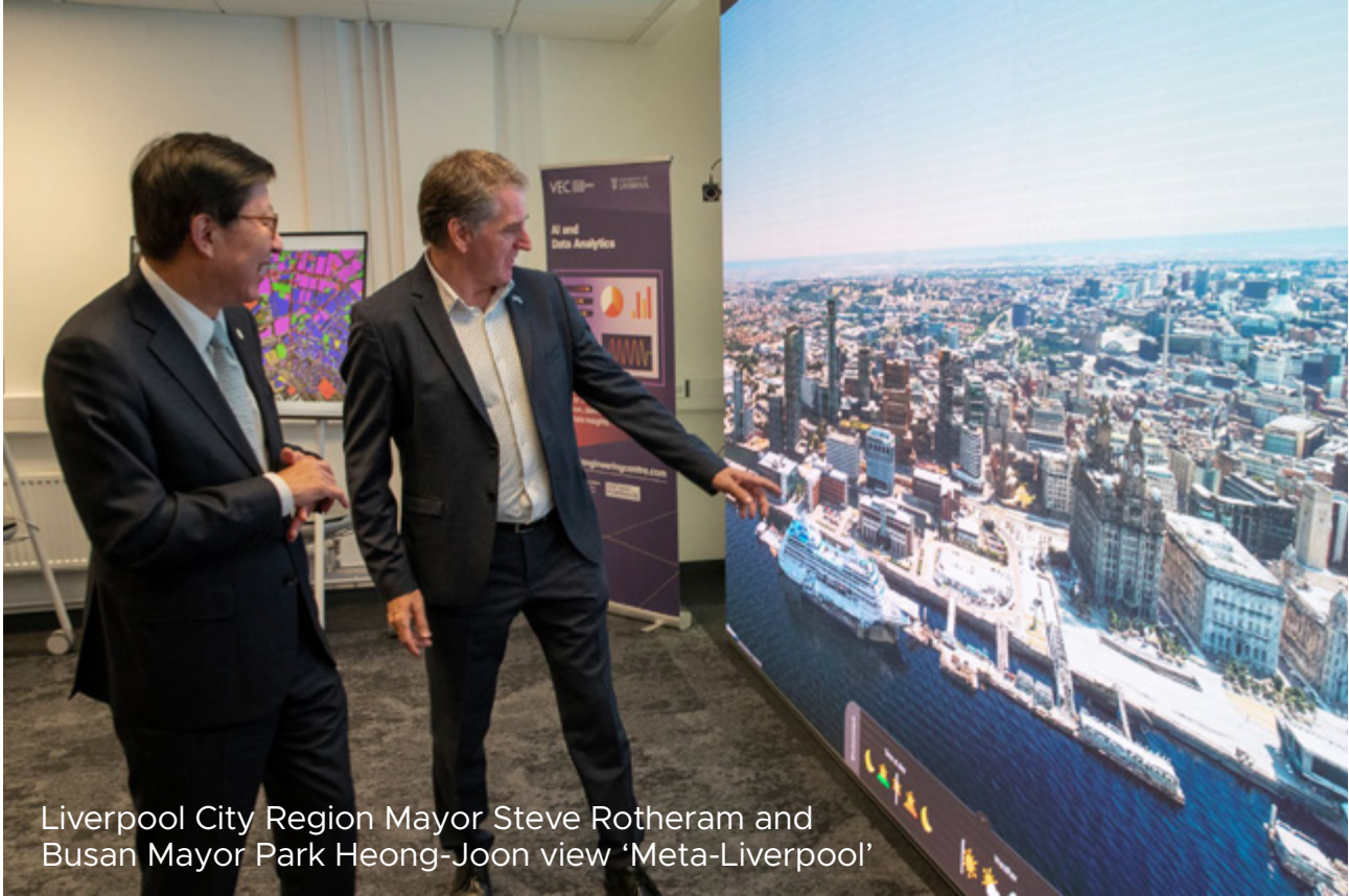
Liverpool City Region Mayor Steve Rotheram and Busan Mayor Park Heong-Joon view 'Meta-Liverpool'