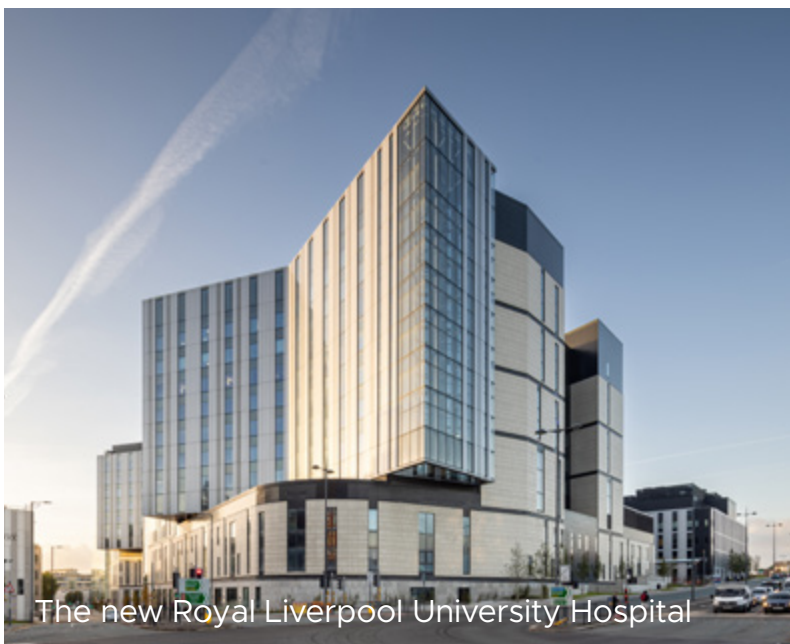
The new Royal Liverpool University Hospital