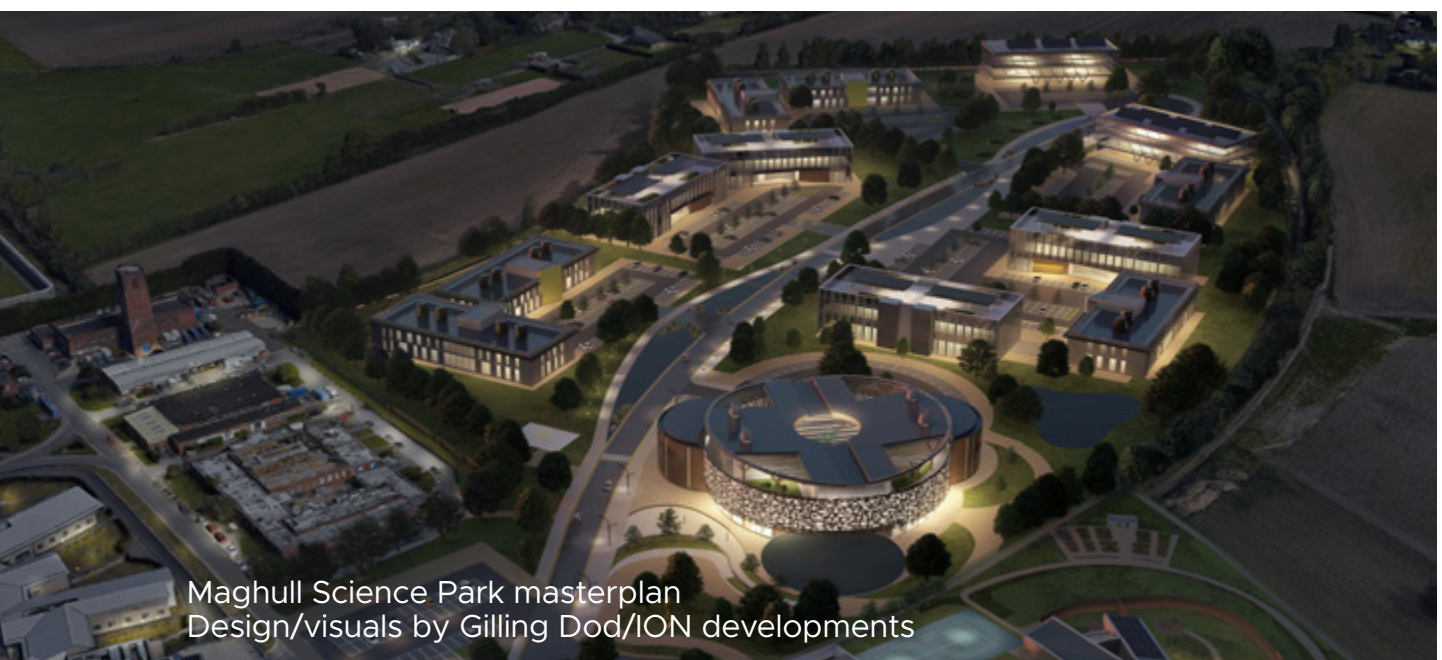
Maghull Science Park masterplan Design/visuals by Gilling Dod/ION developments

Key Investment Zone locations are the north of England's only national