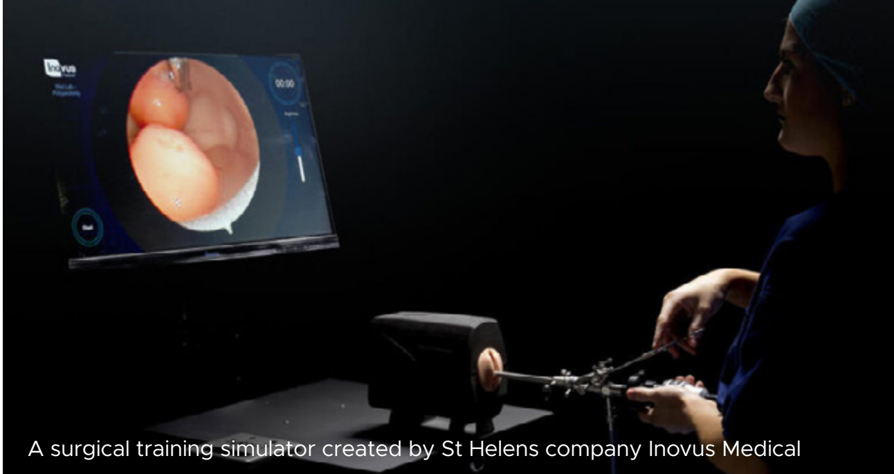
A surgical training simulator created by St Helens company Inovus Medical