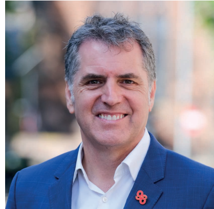
Steve Rotheram, Mayor of the Liverpool City Region

I will provide visible leadership and champion Social Value within and beyond the Liverpool City Region.