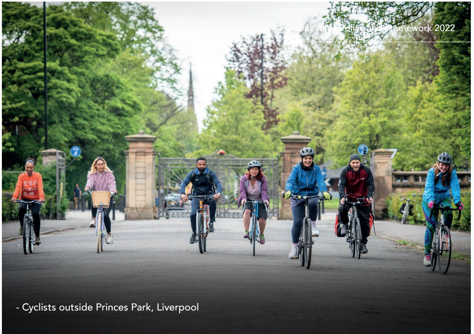
- Cyclists outside Princes Park, Liverpool