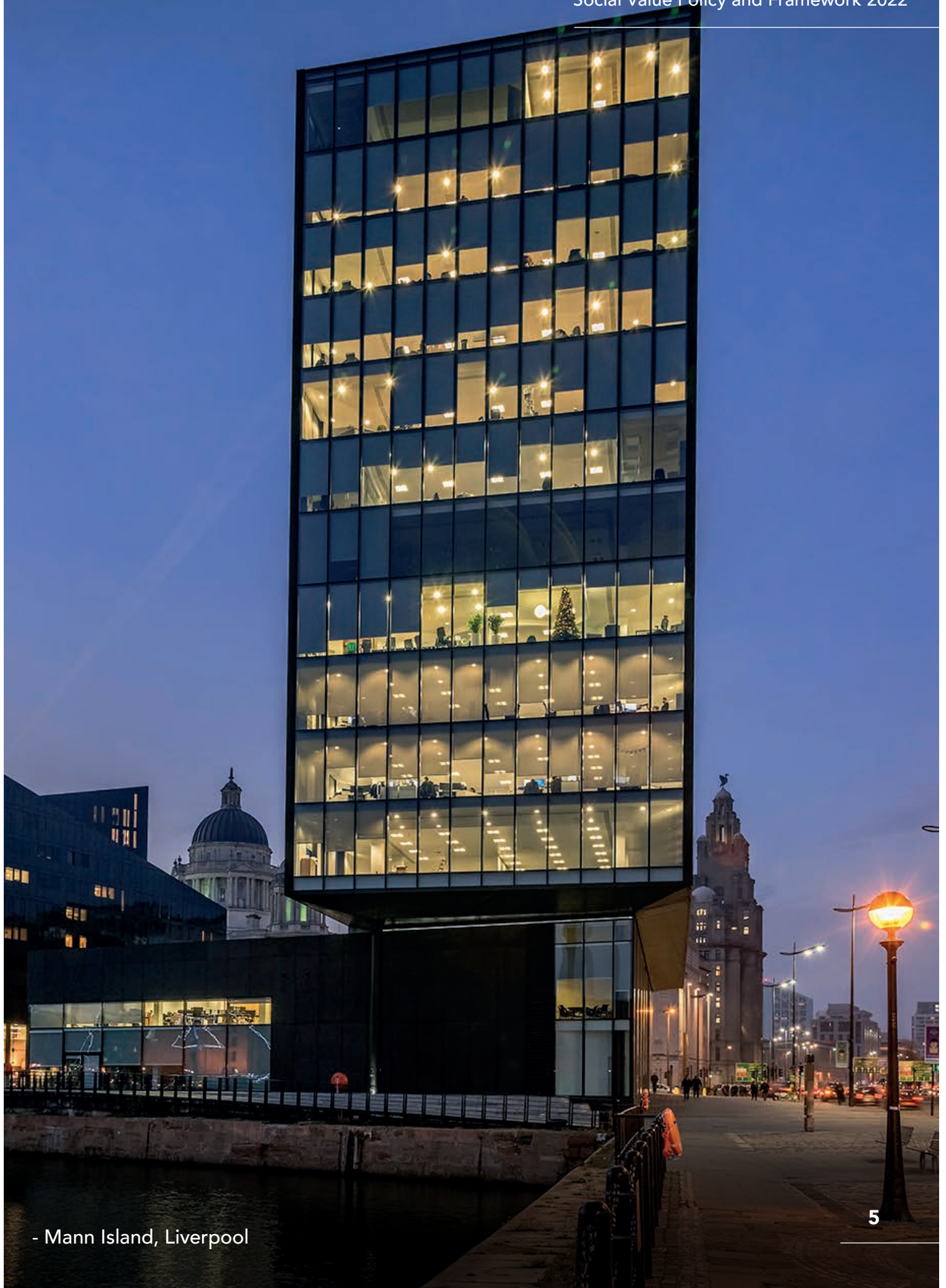
- Mann Island, Liverpool