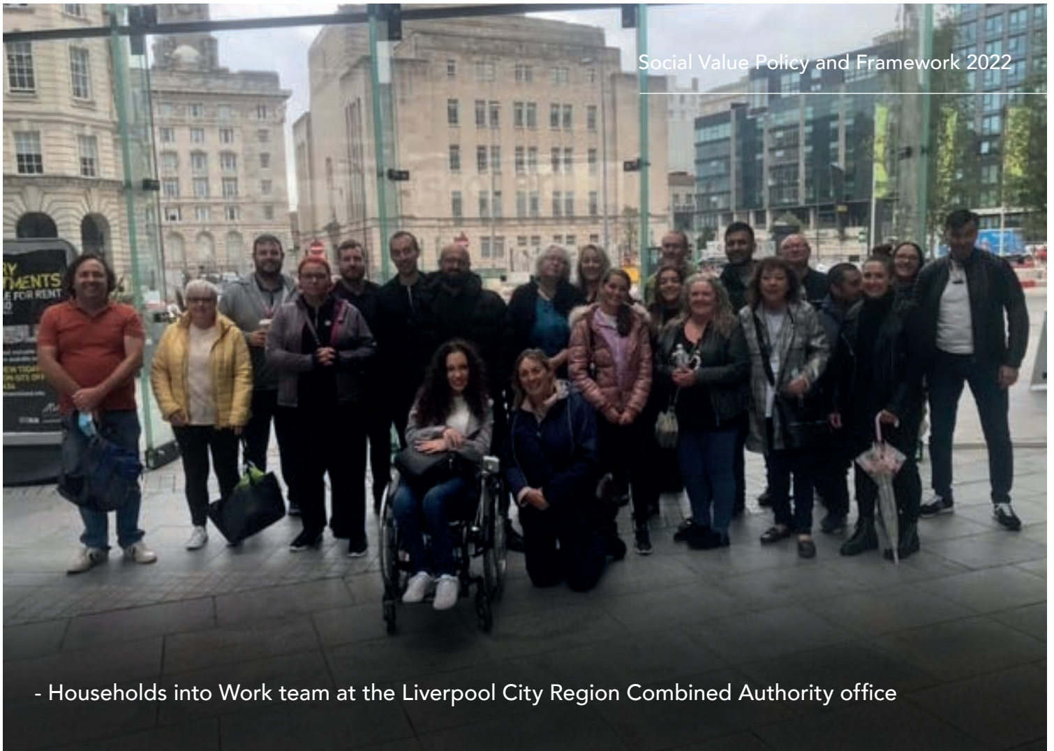
- Households into Work team at the Liverpool City Region Combined Authority office