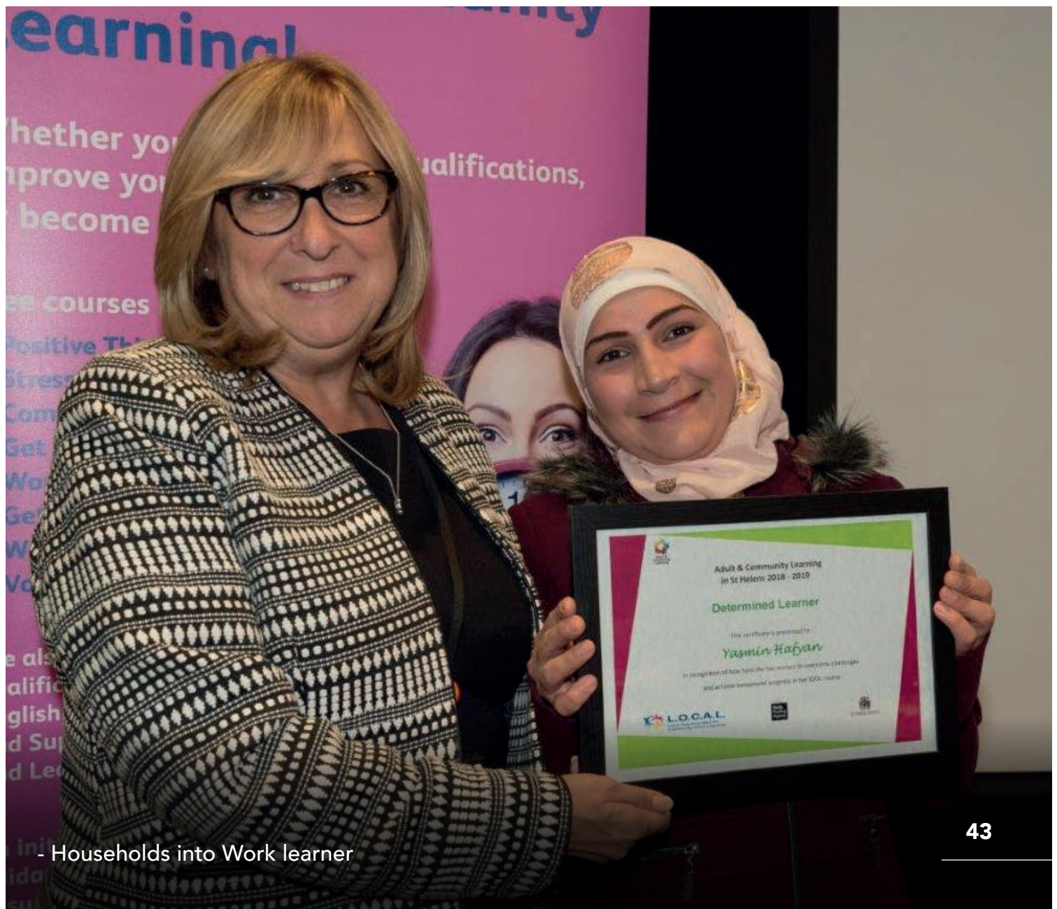
- Households into Work learner